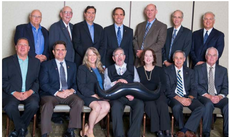
SCCAI Past Presidents