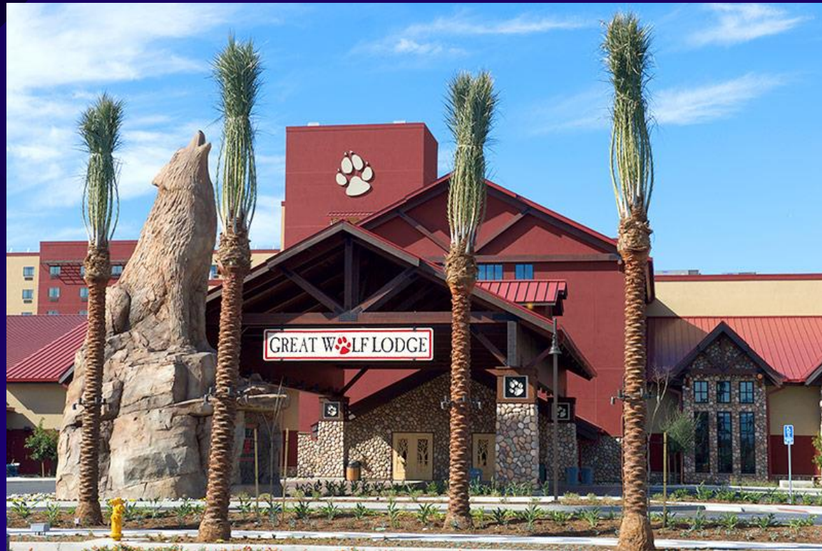
Great Wolf Lodge Garden Grove / 603 rooms