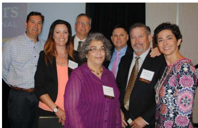
The IEMT's Team

We experienced another information filled day; networking event and SCCAI General Meeting at the Inland Empire Market Trends Seminar, held this year on Thursday, June 2 nd at the Doubletree Hotel in Ontario. SCCAI 2017 Officers were nominated and elected during the General Meeting. The event continues to grow with over 120 people in attendance.