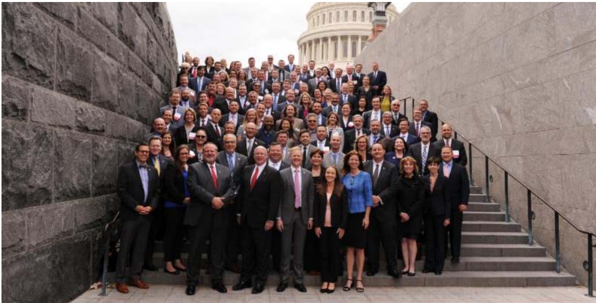
Participants at the 2017 LDAC Meetings this May in Washington D. C.