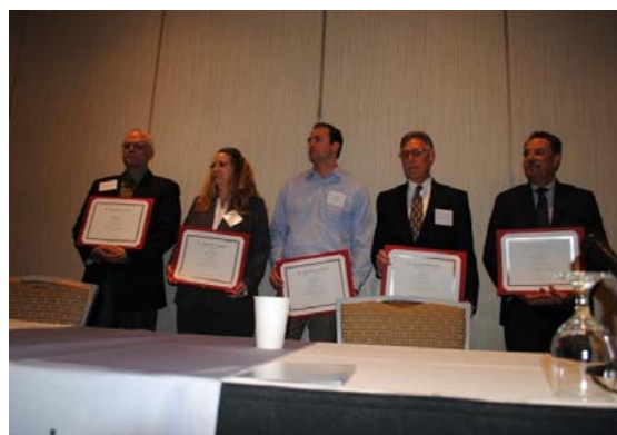
Members receiving Designations at IEMKT