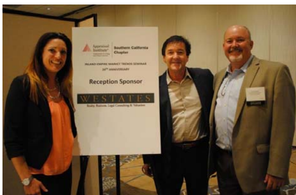
Thanks to our Reception Sponsor!