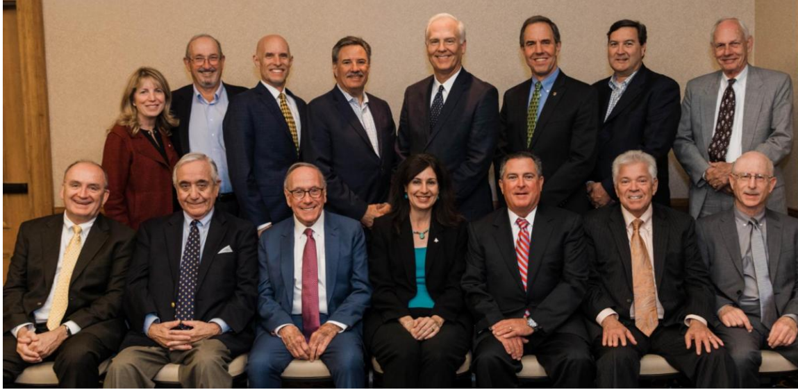
SCCAI Past Presidents